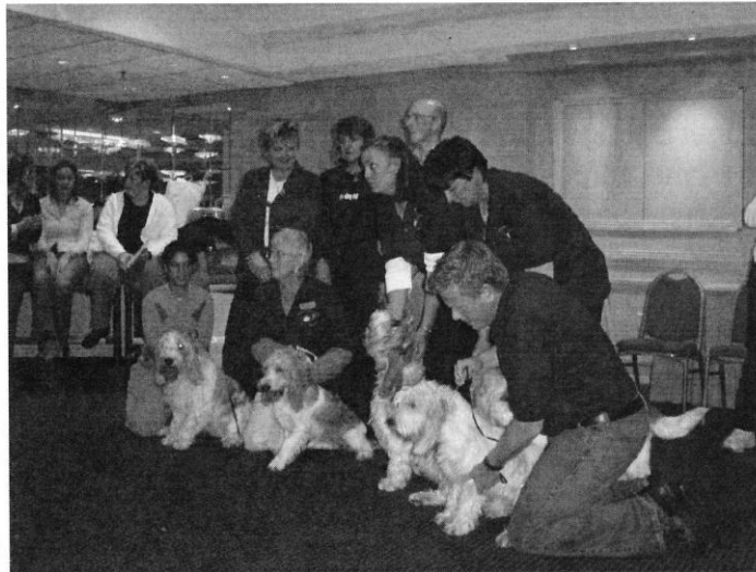
GBGV Group at the meeting