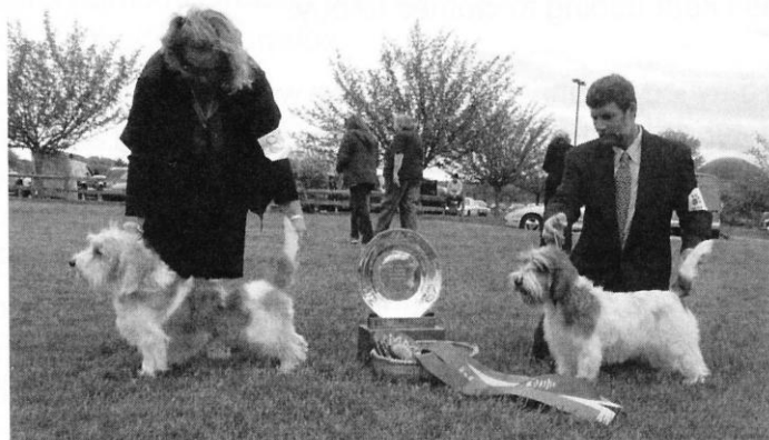
Left - BOS Ch Jombris Hot Shot Le Chasse and Right - BOB Ch Celestial CJ's Celestial Fairchild