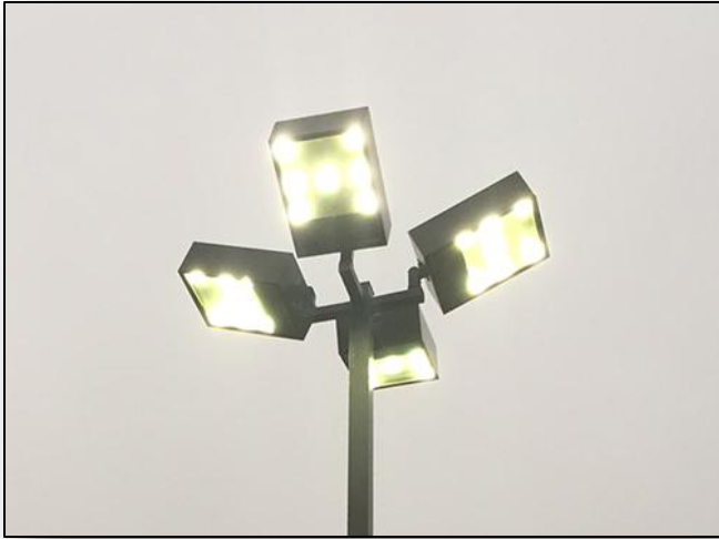
LED Energy Saving