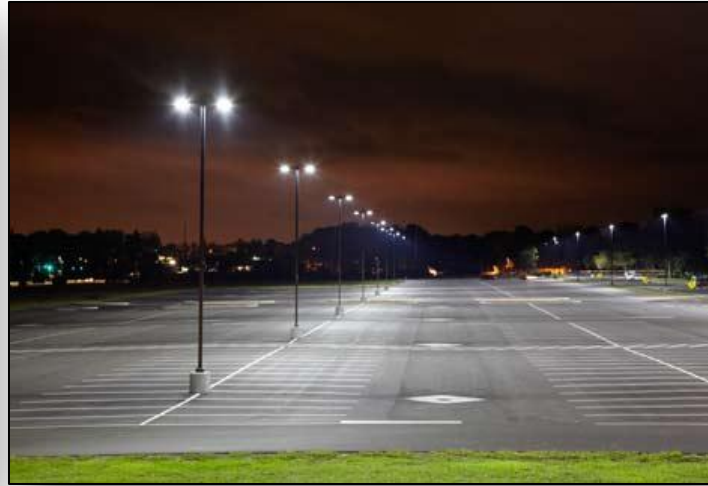
Safety in Lighting