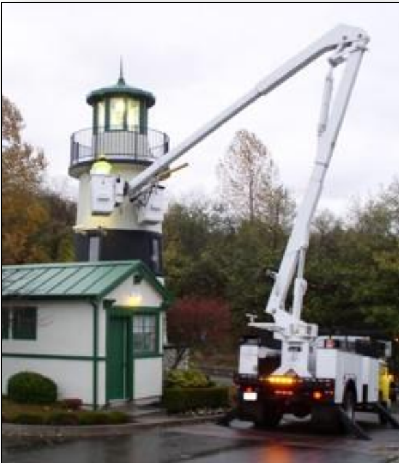
Equipment to do the Job