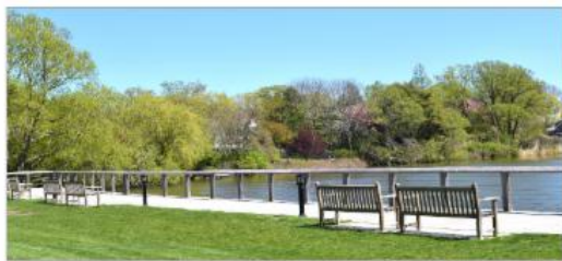
1 POND LANE, SOUTHAMPTON VILLAGE

The best commercial re-build opportunity in Southampton Village. On the corner of Hill Street and Jobs Lane, adjacent to Monument Square and Agawam Park, sits the iconic B&M automotive garage (zoned Village Business). The property offers EXTRAORDINARY VISIBILITY and is at the gateway to Southampton Village's most prestigious Estate Section and retail shopping/restaurant district.