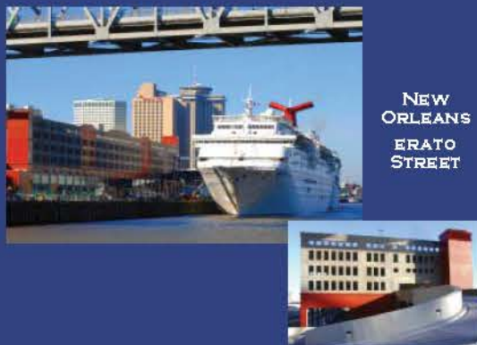
NEW ORLEANS ERATO STREET