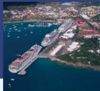
ST. THOMAS, USVI