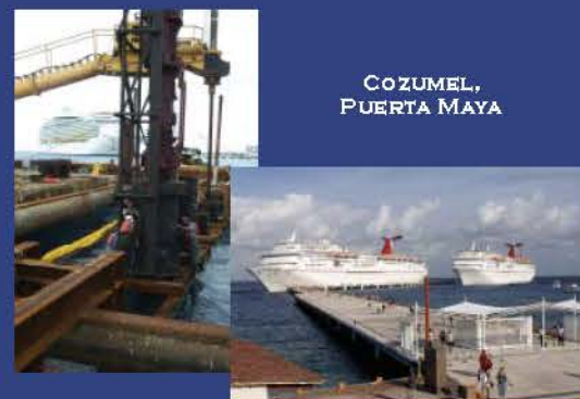
COZUMEL, PUERTA MAYA