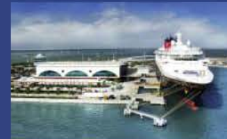
PORT CANAVERAL CRUISE TERMINAL 8