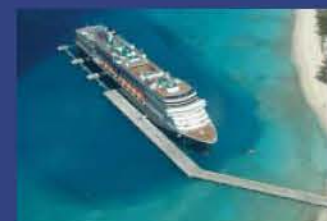
GRAND TURK CRUISE PIER, TURKS & CAICOS