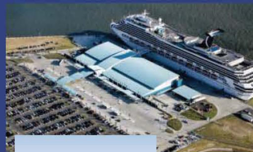
HOUSTON BAYPORT CRUISE TERMINAL