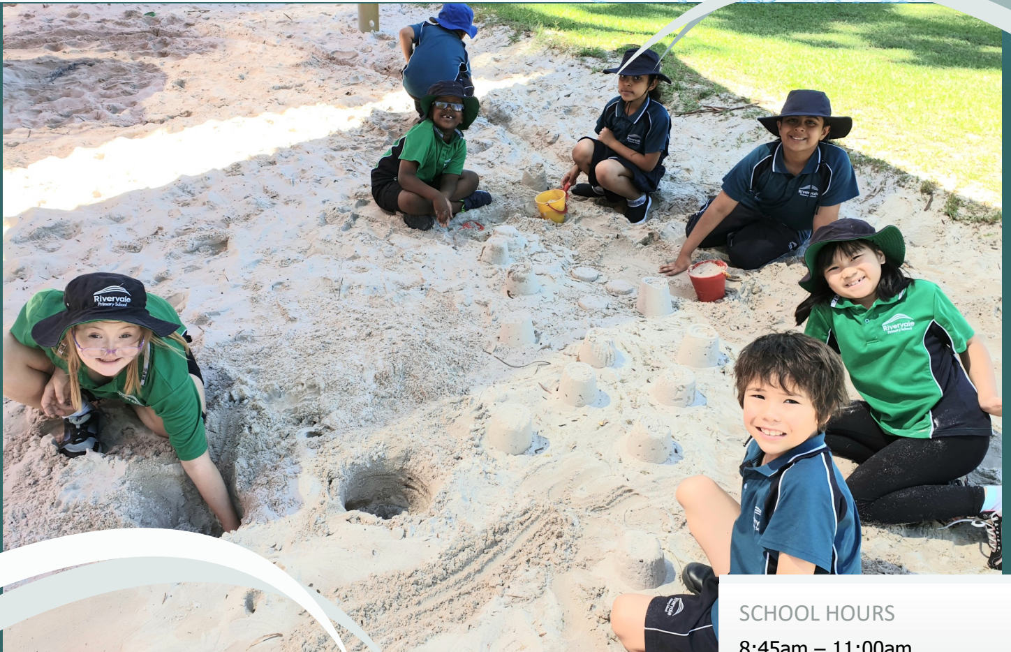
Children of all ages enjoying some sand play as part of our whole school play plan.

I would like to thank all parents for your great support over this first term. You have welcomed new staff, embraced new programs and really got behind all of the school initiatives. It is this positive and collaborative partnership between home and school that makes the difference. Enjoy the April/Easter break with your children.