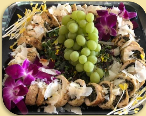
Chicken Pecorino Platter

Shrimp Cocktail Large fantail shrimp, with cocktail sauce, lemon wedges, horseradish, and crackers.