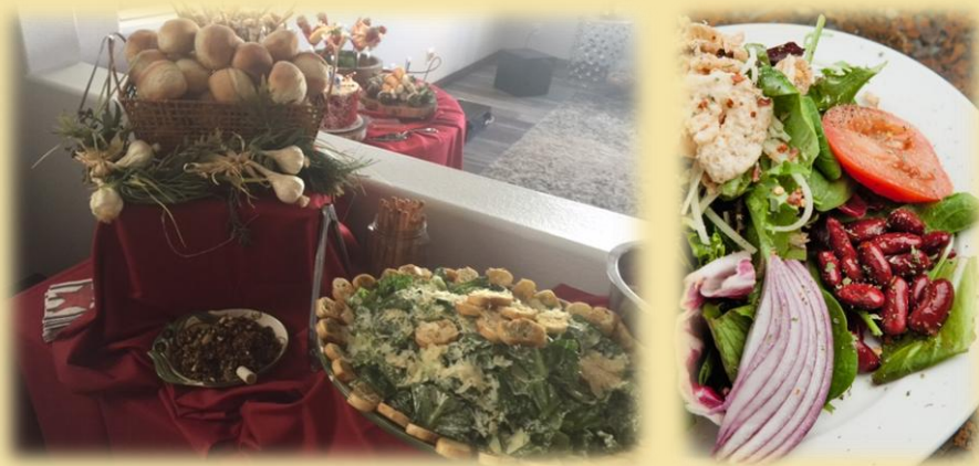
Caesar with Bread and Tapenade

Caesar Salad - Crisp romaine lettuce tossed with shaved parmesan, grated romano, caesar dressing and roasted croutons. Small 25. Large 50.