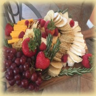
Cheese and Fruit