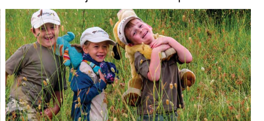
Ewanjan Tented Camp Ndutu Mobile Tented Camp