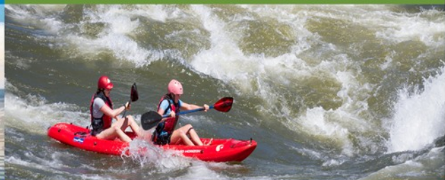
Kayaking - Half Day - $95pp (Min 2 Pax) - Full Day - $125pp