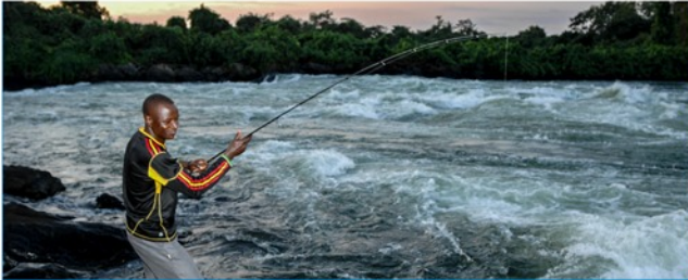
Fishing from the island ($15 per rod hire per 2 hrs)