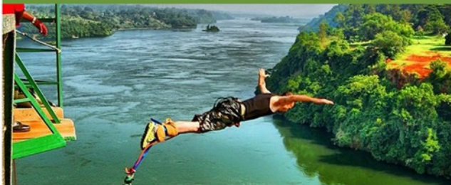
Nile High Bungee Jump ($115pp)