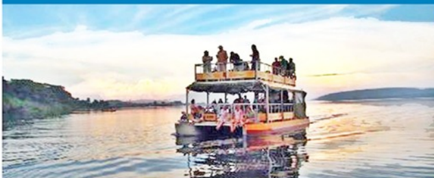
Nile lunch cruise ($30pp)