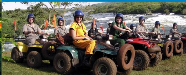
Quad Biking ($50 - 1 hr per pax)