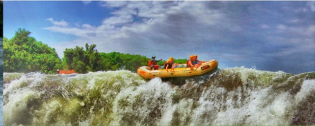
Whitewater Rafting - Half Day - $125pp - Full Day - $140pp