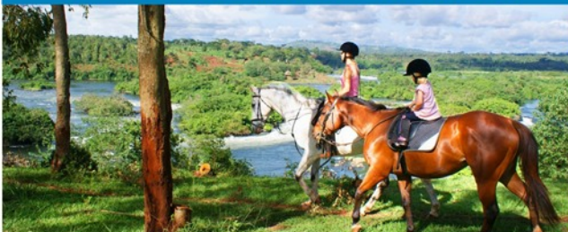
Horse Riding ($60 - 2 hr per pax)