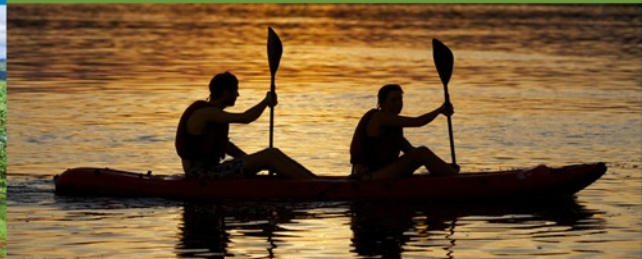
Sit on Kayaks/Stand Up Paddle Board ($75pp min. 2 pax)