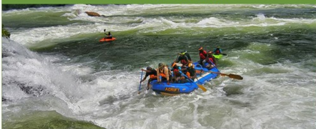
Bungee Raft Combo ($195pp)