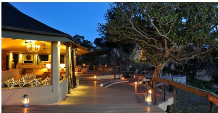
Lemala Kuria Hills, Lemala Mpingo Ridge and Lemala Nanyukie

standard excludes: premium drinks, motorized watersports (The Manta Resort), personal tips, phone calls and others not reflected in the includes.