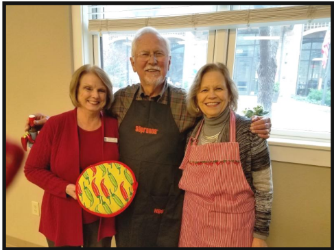
Last year's chili champions

Church Office 828 295-7675 Mailing Address: Rumple Memorial Presbyterian Church PO Box 393 Blowing Rock, NC 28605