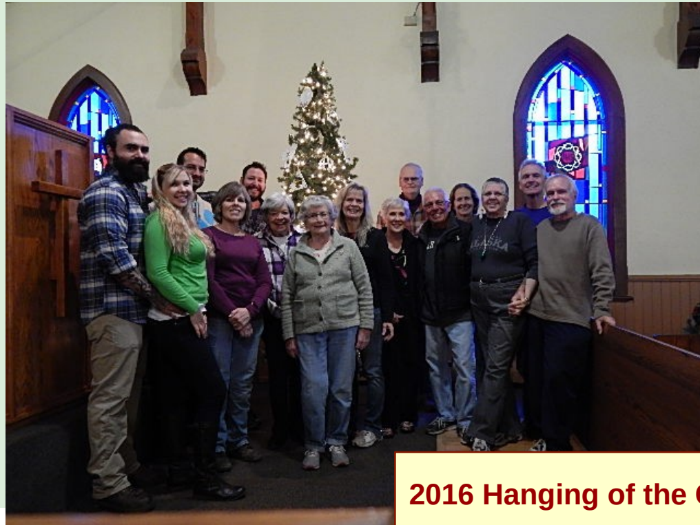
2016 Hanging of the Greens