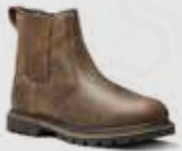
V1261 Rancher Leather Non-Safety Dealer Boot