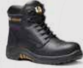
VR640 Bison Black Metal-Free Derby Boot