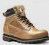
V1244 Mahawk Vintage Leather Chukka