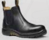
VR609 Colt Black Dealer Boot