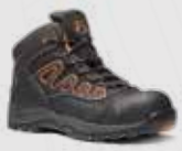
V8430 Aztec Orange/Black Urban Hiker