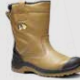
VR696 Lynx Tan Low Cut Rigger Boot