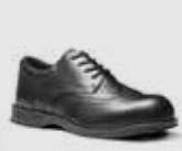
VC100 Diplomat Black Executive Brogue Shoe