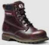
V1236 Boulder Rich Mahogany Hide Derby Boot