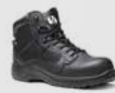
VR550 Extreme Black Metal-Free Boot