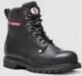
V1235 Boulder V1235XL Boulder XL Black Leather Derby Boot

Full product information is available on our website V12footwear.com