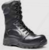
E2020 Invincible E2020XL Invincible XL Black High Leg Waterproof Boot