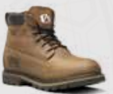
V1264 Torrent Leather Non-Safety Waterproof Derby Boot