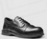
VC101 Envoy Black Executive Oxford Shoe