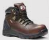
V1219 Storm Full Grain Waterproof Hiker in Antique Leather