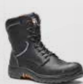
VR620 Avenger Black High Leg Zip Side Boot