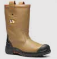
VR690 Grizzly Tan Fleece Lined Rigger Boot