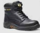
VR600 Bison Black Waxy Derby Boot