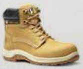
VR602 Puma Honey Nubuck Boot