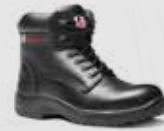
V6400 Otter Black Metal-Free Derby Boot