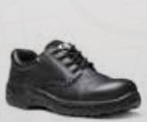
VR608 Tiger Black Derby Shoe