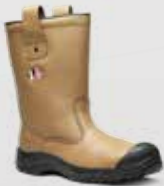
V6816 Polar Tan Fur Lined Rigger Boot