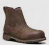
V1231 Rawhide Brown Oiled Leather Dealer Boot