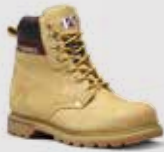
V1237 Boulder Honey Nubuck Derby Boot