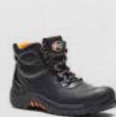
VR657 Endura II Black Tough Comfort Boot