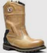
V1250 Tomahawk Vintage Leather Waterproof Rigger