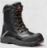
E1300 Defiant E1300XL Defiant XL Black High Leg Zip Side Boot