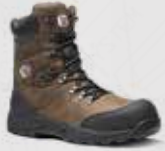
V1255 Rocky Full Grain Zip Sided Waterproof Hiker