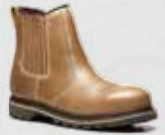
V1241 Stampede Vintage Leather Dealer Boot