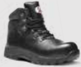
V1215 Thunder V1215XL Thunder XL Black Leather Waterproof Hiker