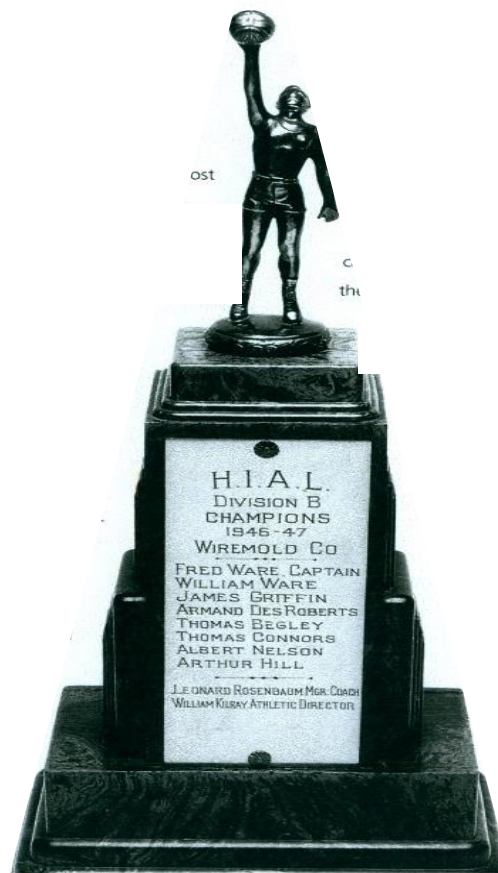
1946-47 H.I.A.L Division B Championship Trophy