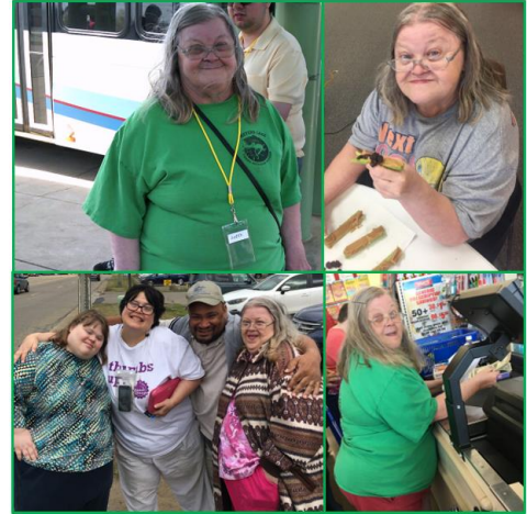
A Ship in Harbor Is Safe, But that Is Not What Ships Are Built For