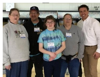
The winning "Celebrity Bowling" team, with their leader the Mayor of Ashland