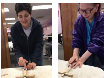
Making catapults to learn about science