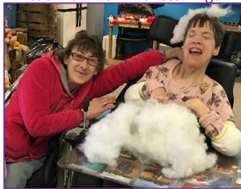
"The Kim's" from NC1, having waaaay too much fun with stuffing!