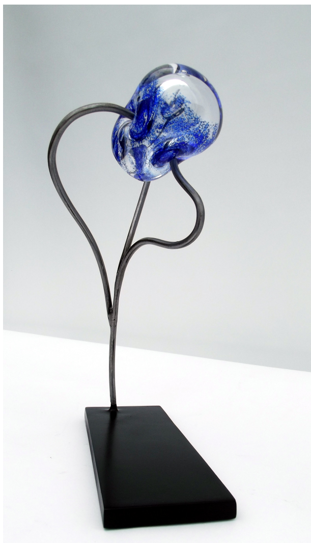
'Pods', Blue' 2016 Steel and Glass Sculpture