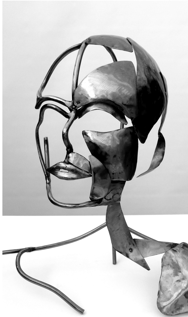
'Sketch Of A Woman' 2017 Steel Sculpture