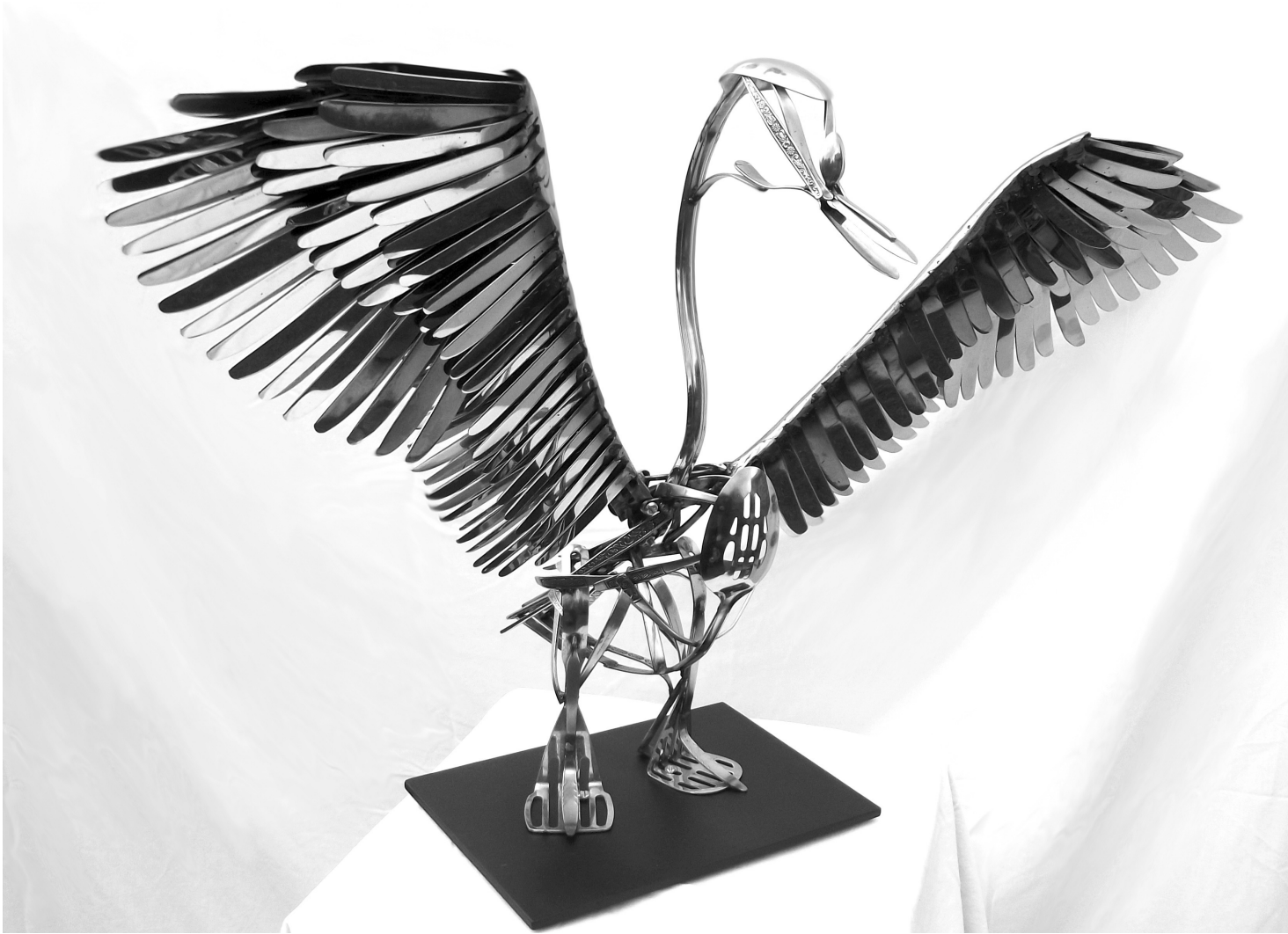
'Swan' Recycled Cutlery Sculpture