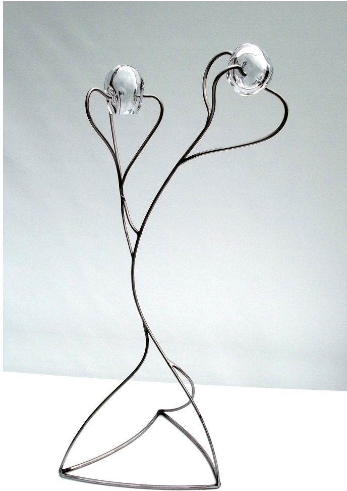
'Pods' 2016 Steel and Glass Sculpture