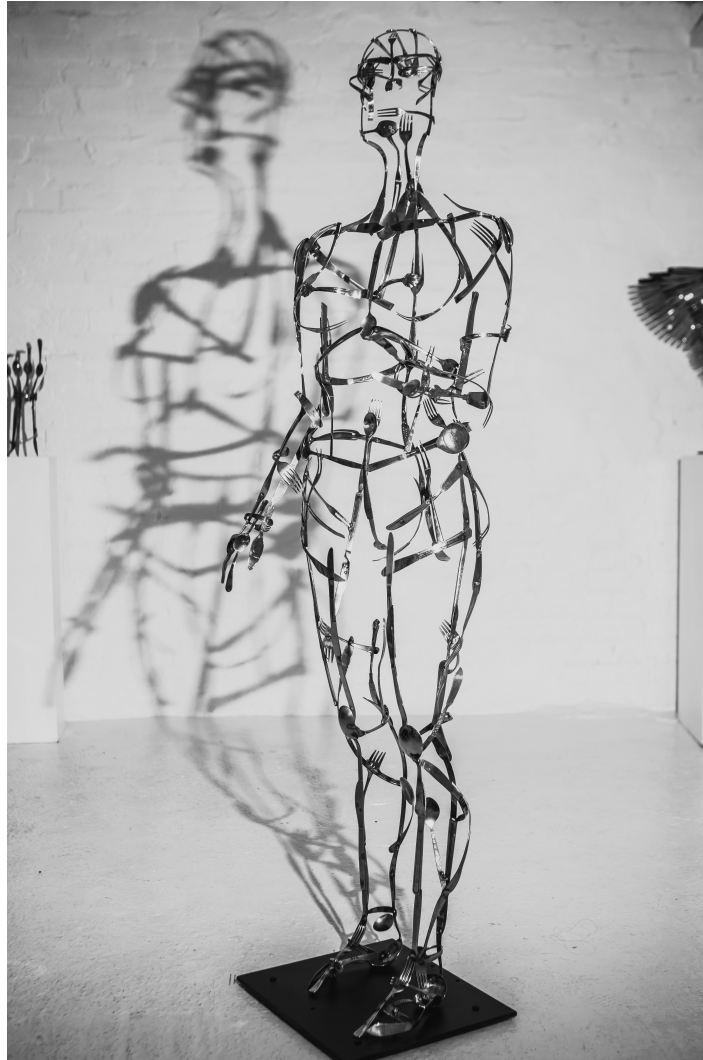
'Woman In The Metal' Recycled Cutlery Sculpture