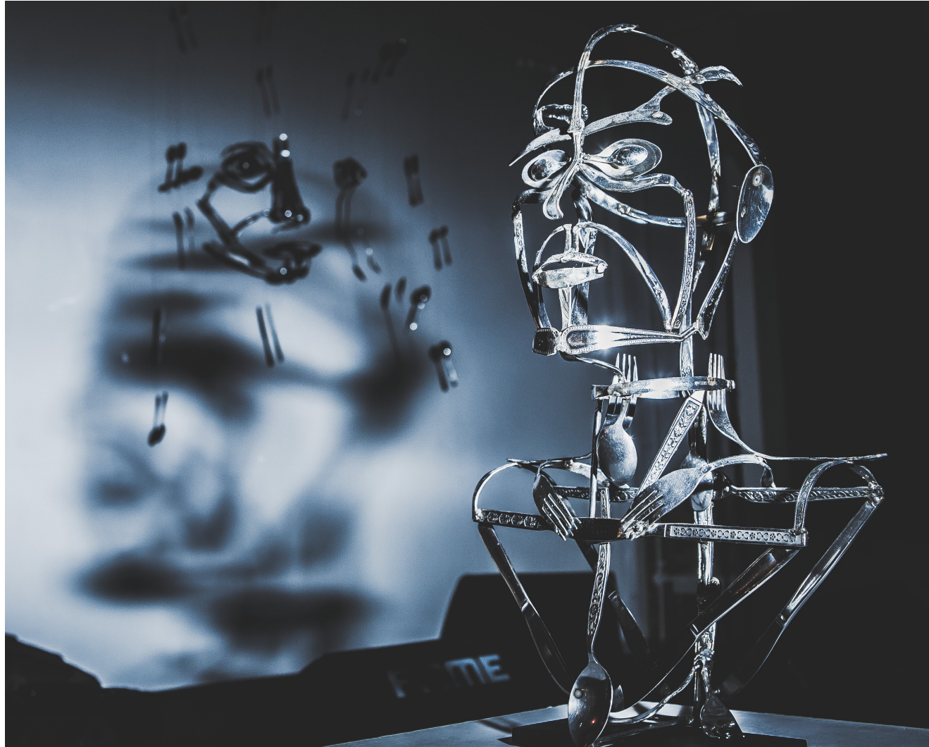
'Bust' Recycled Cutlery Sculpture