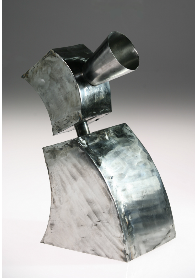
'Steel Trumpeter' Mild Steel Sculpture