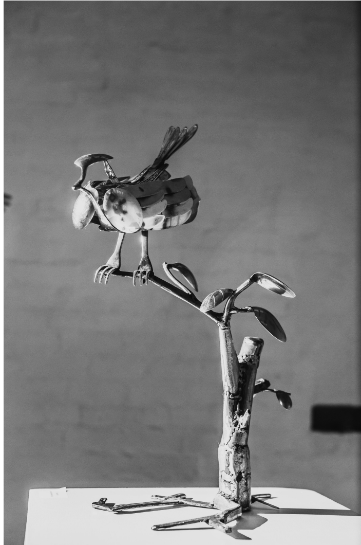
'Bird' Recycled Cutlery Sculpture