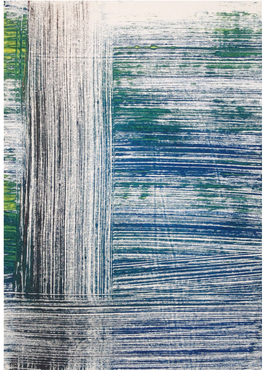
'Urban Land 4' 2016 monoprint