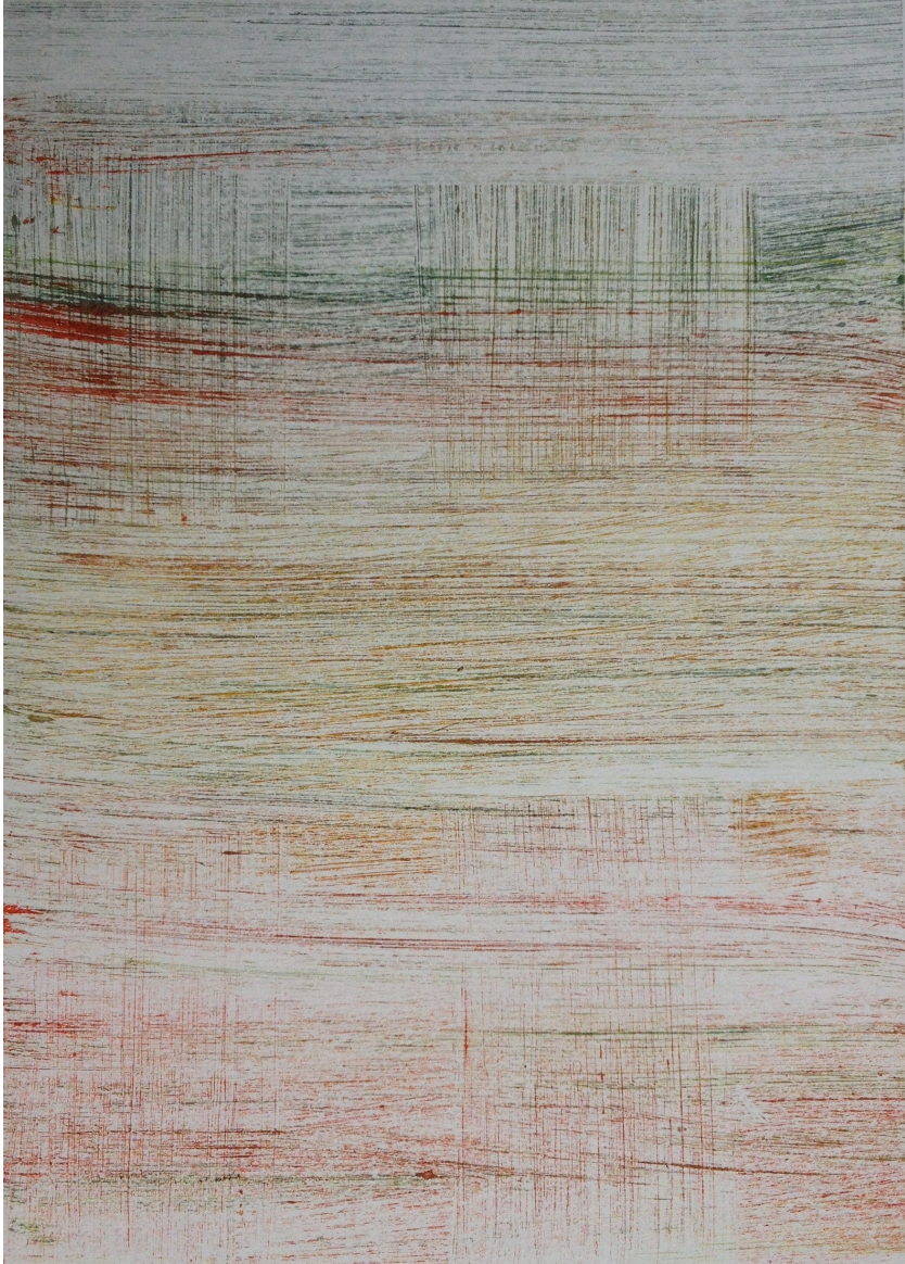
Urban Land III' 2016 monoprint