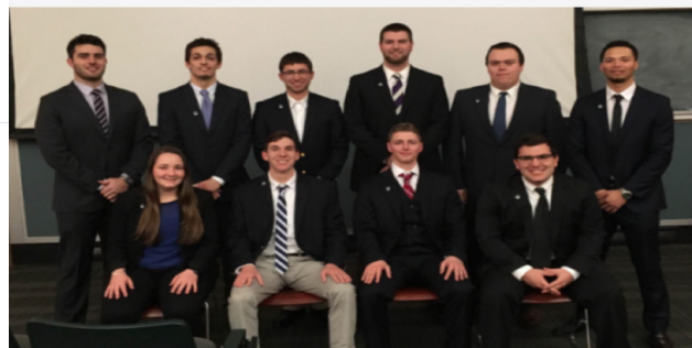
UConn Sport Management Students Attend McCormack Future Industry Leaders Conference at UMass Amherst

“I learned more that day about Sport Management than any other in my first year at UConn”