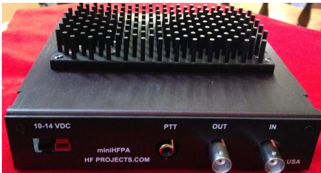
Rear View: RF Connections, Control and DC Power Input

Smart Switching: Your transceiver setting will control the miniHFPA timing sequence. The miniHFPA controller chip controls the internal timing of the T/R relays to provide the proper activation sequences. Standby current is reduced to a minimum during receive mode.