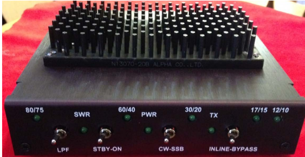
Front View: Toggle switches with LED indicators

Controls: A front panel switch selects Bypass or Inline, allowing you to operate QRP to tune your antenna without subjecting the amp to high SWR. A mode switch selects CW/SSB with appropriate post carrier delays while power is controlled by the standby/On switch. You may key the amp by RF sense or PTT. If PTT is desired, plug into the PTT jack from the transceiver PTT output. The amp timing will slave to the transceiver timing using PTT timing.