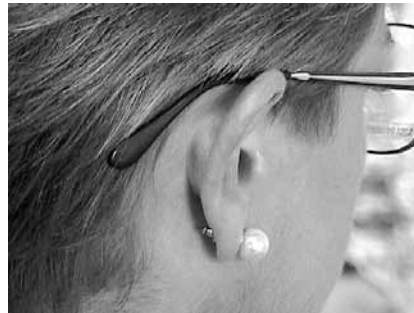
Checking temple length for adjustment