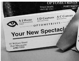
Example of a patient brochure explaining the frame warranty and adaptation advice