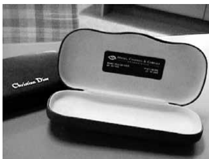
A case sticker should be used to identify the practice inside all designer cases