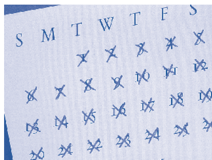
It takes time to make a custom-made item