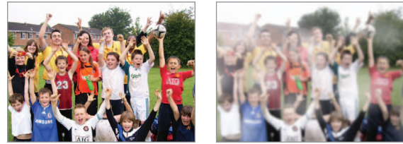
An example of cloudy vision due to cataract