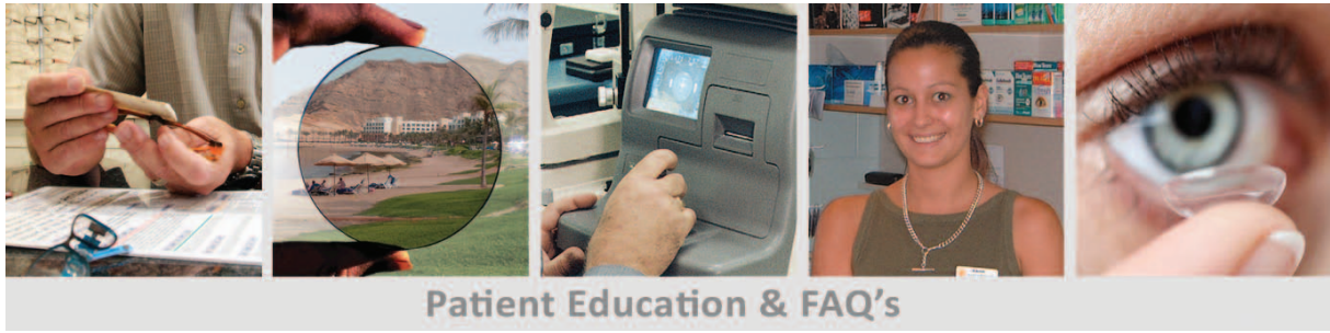
Patient Education & FAQ's