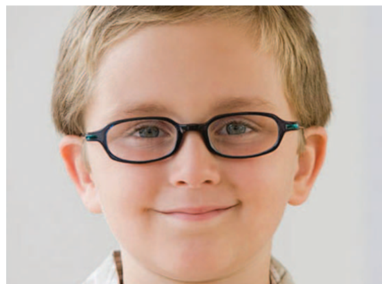
A longsighted prescription is often mainly for eyestrain

This is no problem for most of them, but some 6% with higher degrees of longsightedness or muscle imbalance will suffer symptoms of strain which begin to interfere with their schoolwork. These children will often be able to pass an eye chart test with 6/6 (20/20) distance vision but still have very real visual problems with close work.