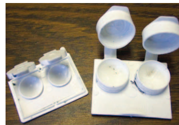
Dirty cases are a source of contamination and infection

Most solutions include a disposable case with each bottle. Discard the old case each time you open a new bottle.