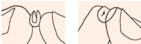
Right-way versus Inside-out