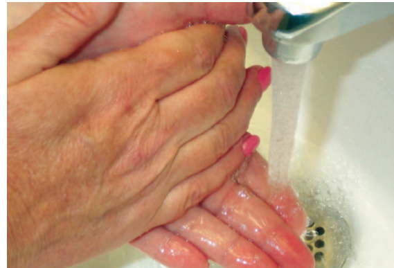
Your eye health is important - don't take shortcuts

Correct hygiene is of prime importance. Before handling the lenses be sure to wash your hands.