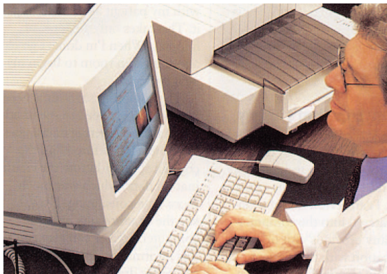
More than 50% have computer eyestrain

However, more than 50% of computer operators experience eyestrain, headaches and blurred vision?