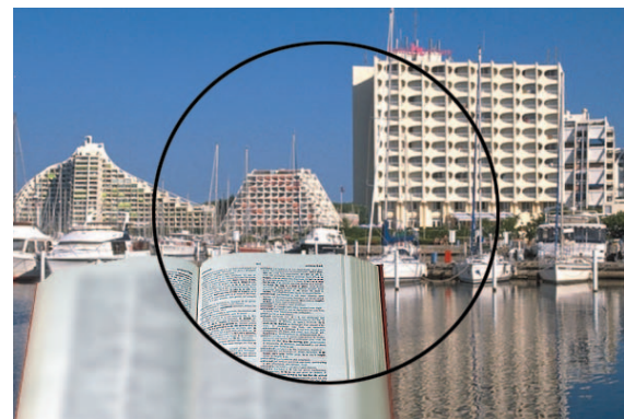
Blurred near vision is corrected with a hyperopic prescription

For older patients, the prescription provides clearer vision rather than the relief of eyestrain.