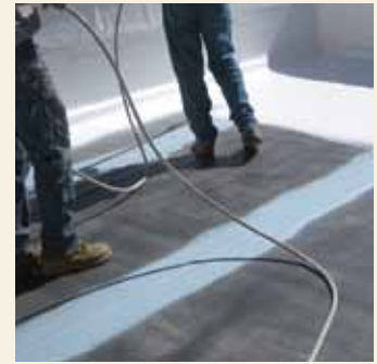
4. Seal entire roof with Rapid Roof III or Equinox top coat.

*See Product Specifications for current pull-test requirements.