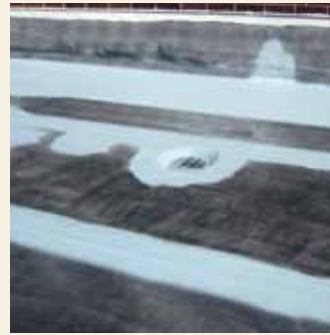
3. Reinforce seams with Spunflex® imbedded in Rapid Roof® III or Equinox® base coat.