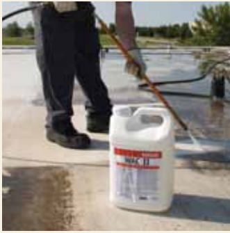
1. Power wash and clean with WAC II® roof cleaner