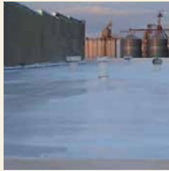
2. Prime surface with Tack Coat™ primer.