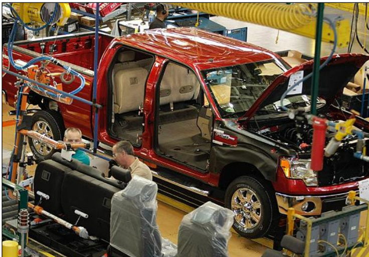
Ford Rouge factory tour