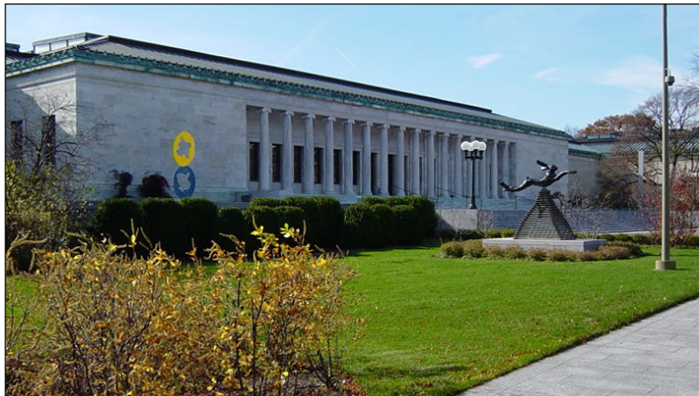
Toledo Museum of Art