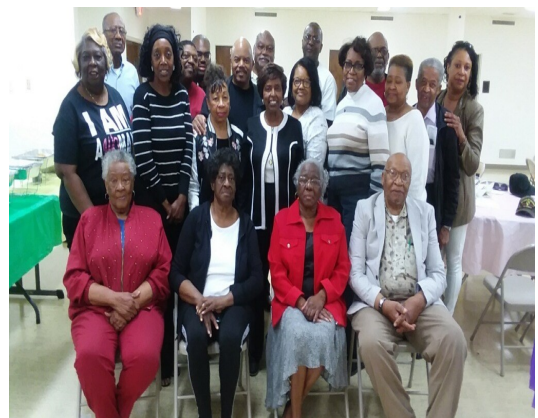
4.20.2019 Ushers Workshop