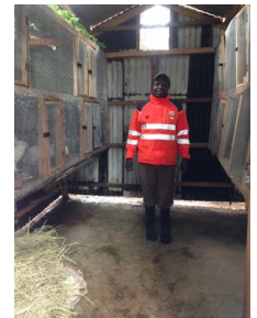
"RABBITS" our school is raising rabbits for education and to sale.