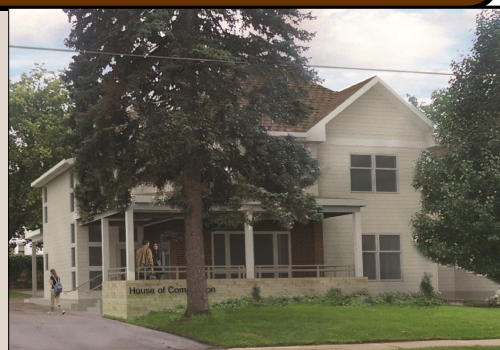
Our Planned Addition That We Wish to Build

God has blessed our houses so graciously, and so many of you have contributed to this ministry. Some for many years. As we look forward to possibly expanding this ministry, we have a long ways to go. But you have helped us to get where we are today. This ministry is built on the financial backing and services of so many people who have come to stay here over the years. Some have come as guests and went on to help fund us through monthly contributions or getting their churches involved in our ministry. Others have served with construction projects such as building porches and bathrooms. Plumbers have used their services to fix our boilers. Others have worked on landscaping, painting, fundraising, and have tirelessly worked to provide a better stay for our guests. For all that you have done, we sincerely thank you, as through you, God has continually met all our needs according to the glorious riches in Christ Jesus!