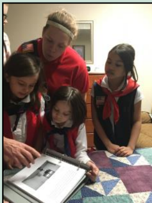
In this photo the girls are looking at a project notebook illustrating a guest room that had been remodeled by another member of this troop for AHG's highest award.