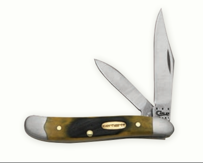
6220 SS 2<sup>7</sup>/8" [7.3 cm] closed 1.2 oz