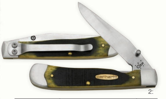
6154LC SS 41/8" (10.48 cm) closed