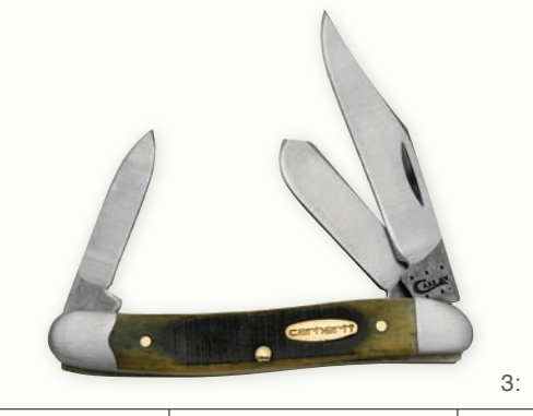
63087 SS 33/8" (8.57 cm) closed 1.8 oz