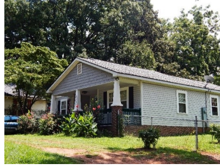
Washington Heights Bungalow