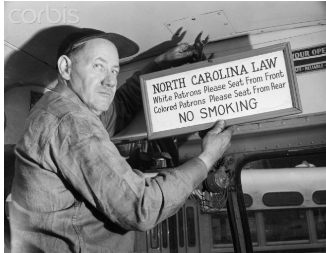
Sign Enforcing Segregated Seating On North Carolina Public Transit