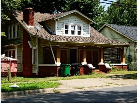
Washington Heights Bungalow Being Restored