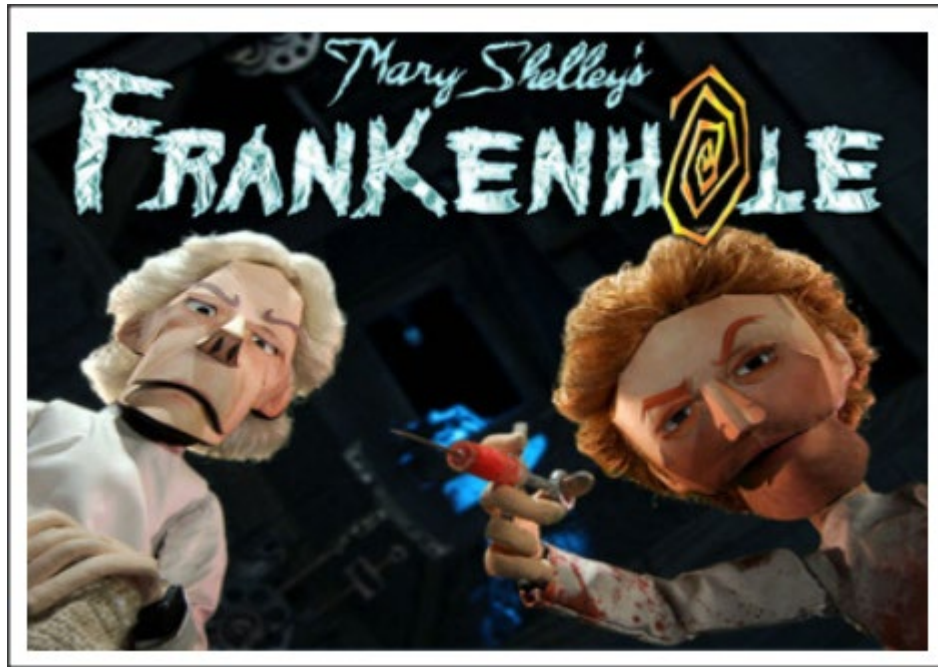
Created by Dino Stamatopolous