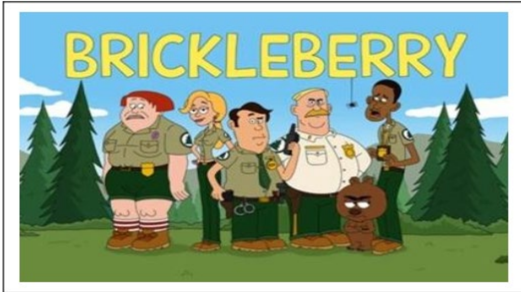
Created by: Waco O'Guin and Roger Black Image: Red and Black