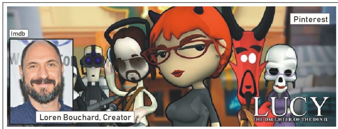
Lucy, Daughter of the Devil