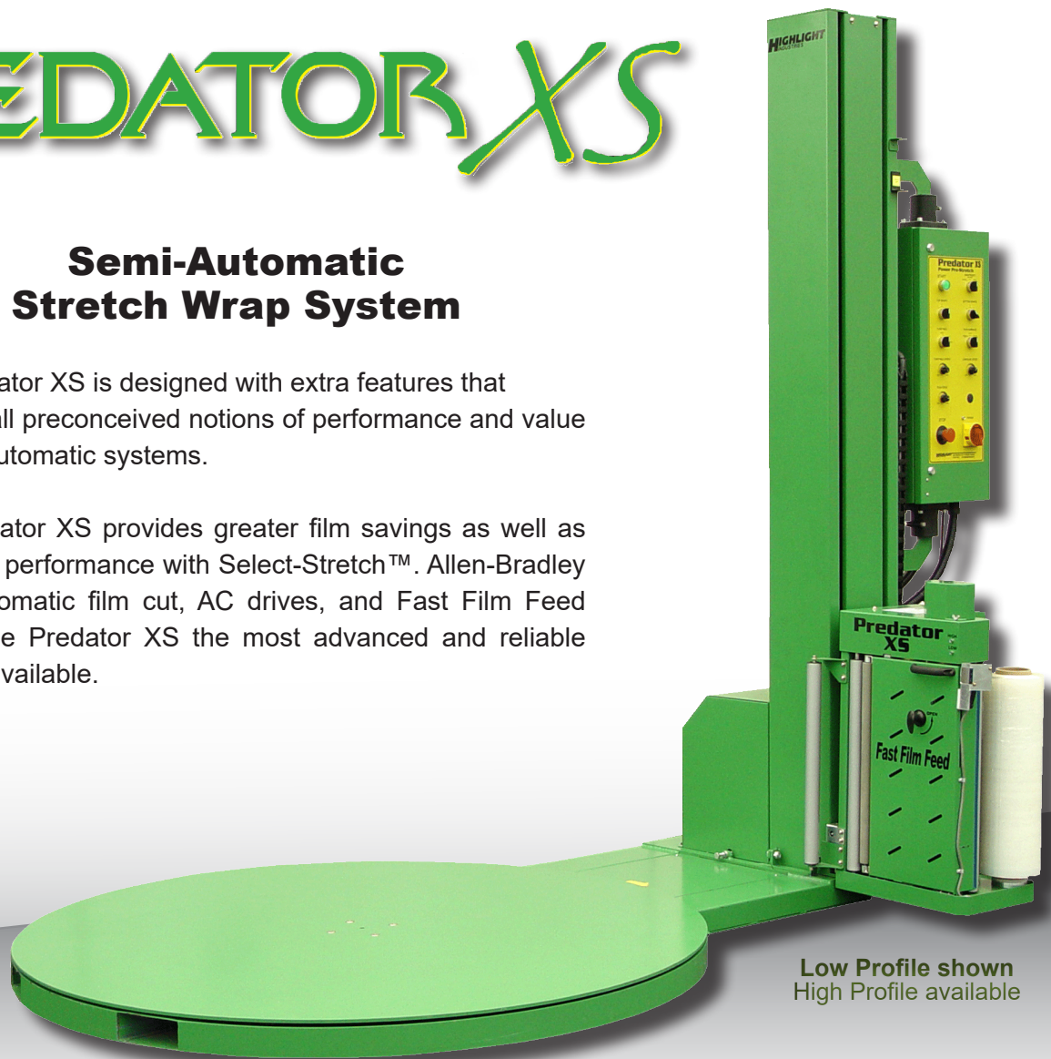
Low Profile shown High Profile available

The Predator XS provides greater film savings as well as improved performance with Select-Stretch™. Allen-Bradley PLC, automatic film cut, AC drives, and Fast Film Feed makes the Predator XS the most advanced and reliable solution available.