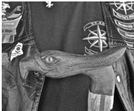
Dee Cote eagle