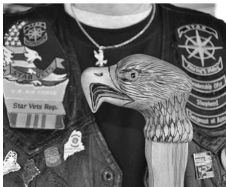
Dee Cote eagle

Cane Project Records: Several carvers have provided cane data for us to update our records. We were able to close many requests that were being held as open. Thank you to all who participate or support our brave men and women who serve our great nation.