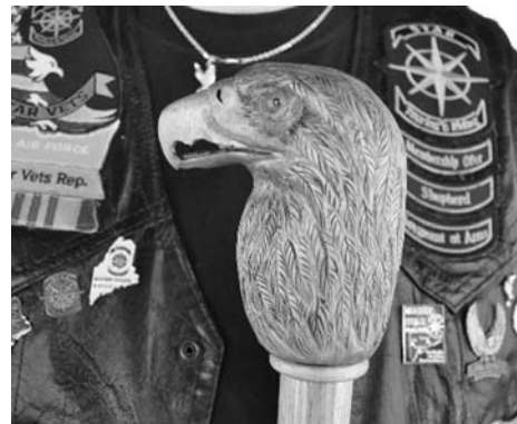
Herb Blake eagle