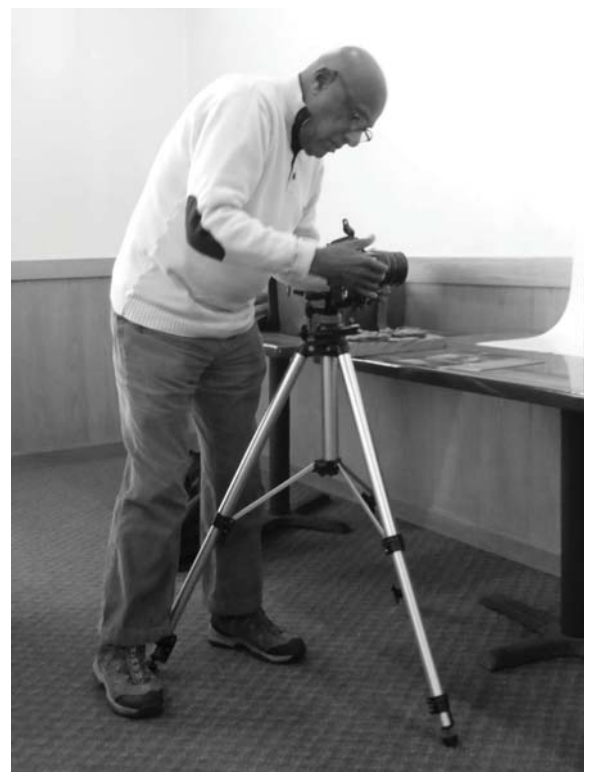
(see Best Light , page 5)

Pay attention to what the view finder sees. In portraiture, to add highlights, use a piece of white paper near the subject's face. If lighting washes out subject, use a gray paper to keep details. The camera always reads the