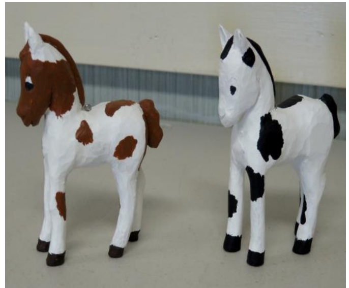
Ponies by Norm Devonshire