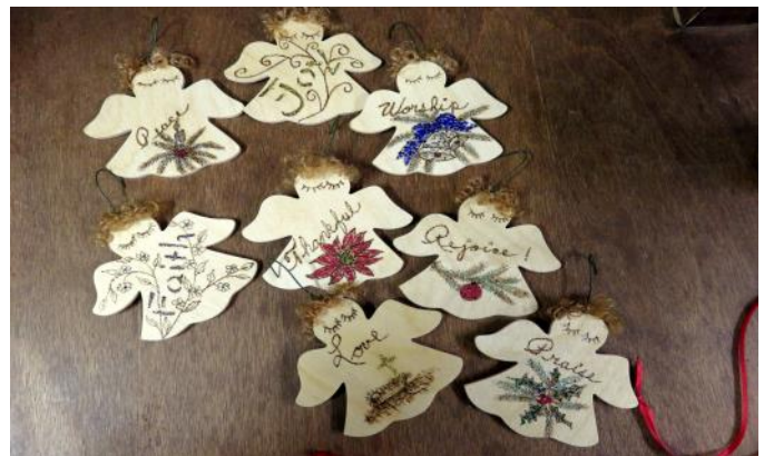
Wood burning by Bernadette Hodgkins