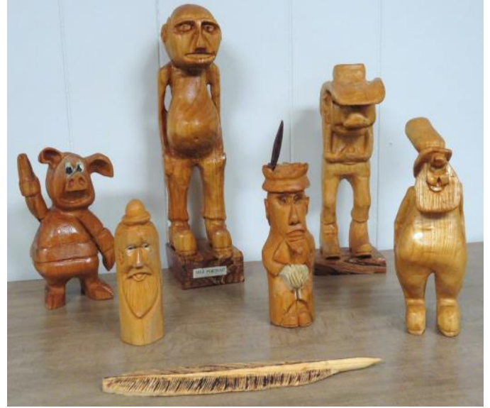
Caricature carvings by Chuck Friis