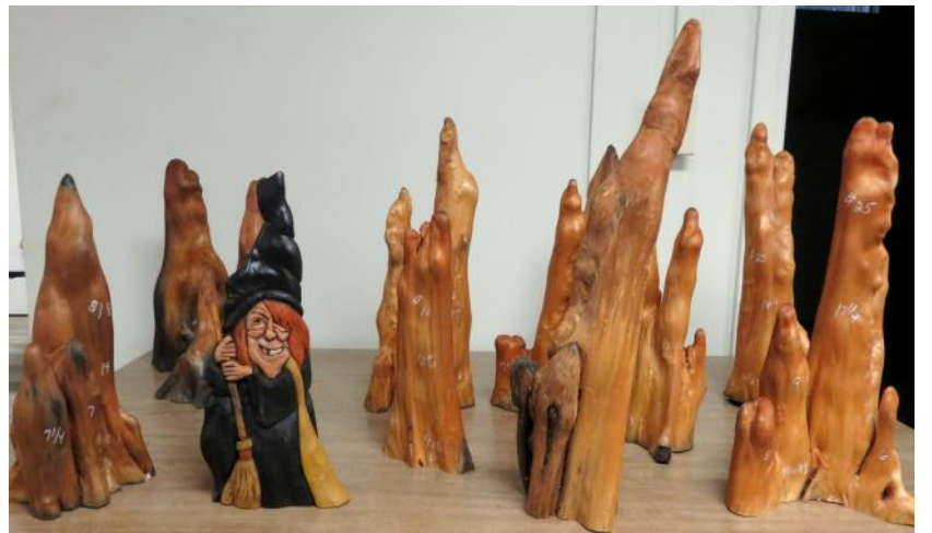
Cyprus knee Santa, Nativity, and Cyprus knee collection by Sally Abrahamson