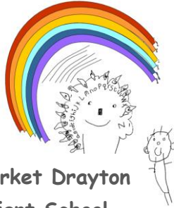
Market Drayton Infant School