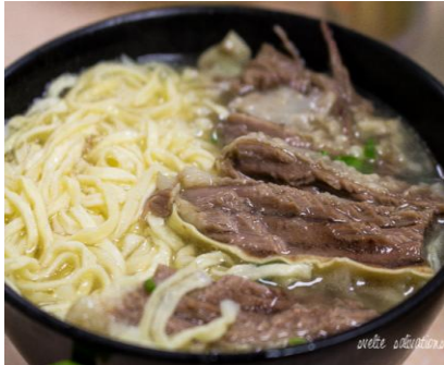
Kau Kee Beef Brisket