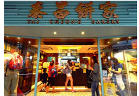
Tai Cheong Bakery