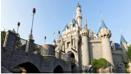
Hong Kong Disneyland