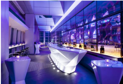
Ozone at the Ritz Carlton