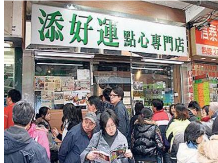
Tim Ho Wan