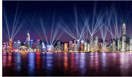
A Symphony of Lights