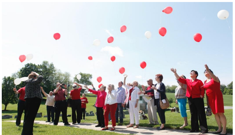
Pentecost Sunday balloon release

ABLAZE YOUTH GROUP WILL PROVIDE A PASTA DINNER