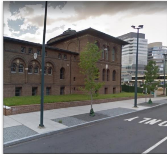
View of Museum building from 33rd Street