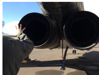
The business end of a jet fighter