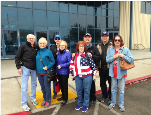
Above: We're ready for our tour

A Diablo Valley Mustang Association Publication