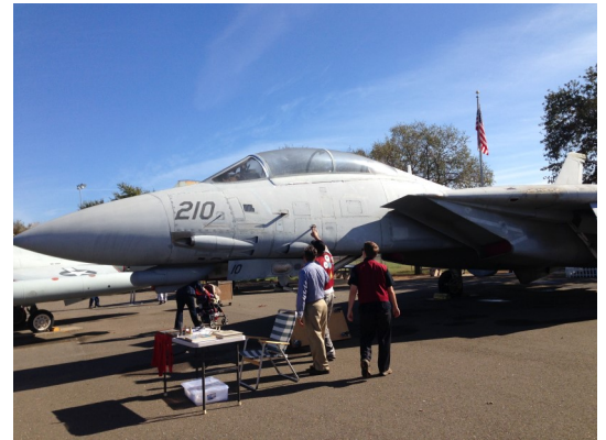
Former mechanics loved showing us all the gadgets on these planes