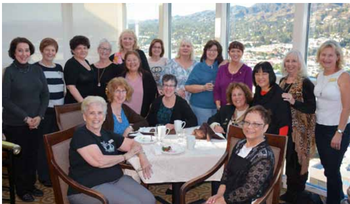
NSD Queens, past, present and future enjoyed the laid back hospitality from the 19th floor lounge.

The weekend festivities started with a wonderful hospitality event on the 19th floor, with views overlooking the city on such a glorious southern California day. What a spectacular way to meet my fellow queens and try to remember the names and faces! So fitting for the wonderful group of people who gathered for this special occasion!