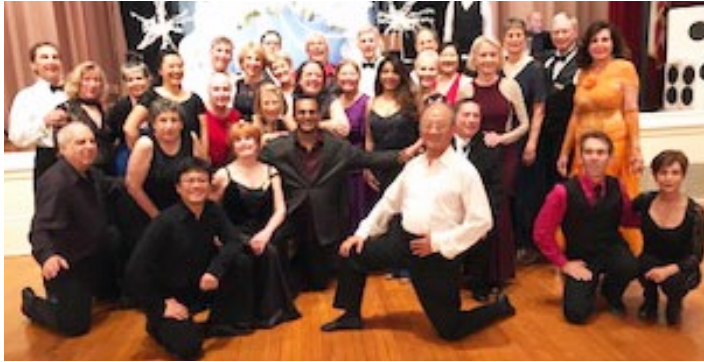
SFV Dancers At Their Best In Bakersfield

The annual Spring Bakersfield dance weekend was enjoyable for everyone. The James Bond theme was enthusiastic and thrilled all 40 of the SFV members that attended with our SFV Formation Team performing their dynamic Tango routine. Congratulations to all who attended and participated in the many competitions. Every year we sincerely look forward to this special dance weekend!