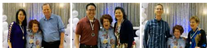
1st - Intermediate Smooth 2nd - Intermediate Smooth 3rd - Intermediate Smooth