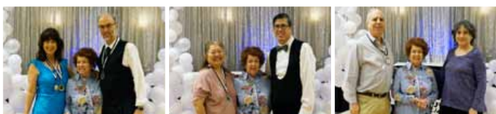
1st - Intermediate Rhythm 2nd - Intermediate Rhythm 3rd - Intermediate Rhythm