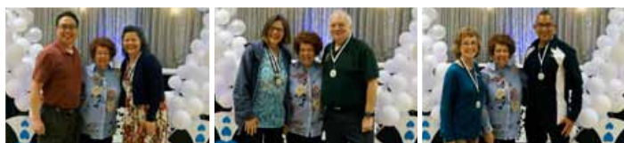
1st - Beginners Waltz 2nd - Beginners Waltz 3rd - Beginners Waltz