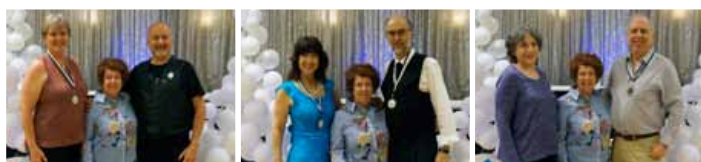
1st - West Coast Swing 2nd - West Coast Swing 3rd - West Coast Swing