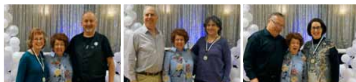
1st - Senior Waltz 2nd - Senior Waltz 3rd - Senior Waltz