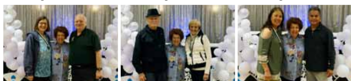
1st - Beginners Cha Cha 2nd - Beginners Cha Cha 3rd - Beginners Cha Cha