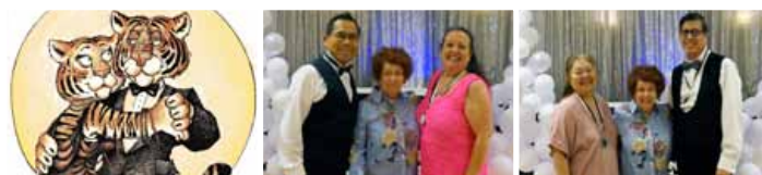
1st - Advanced Smooth 2nd - Advanced Smooth 3rd - Advanced Smooth