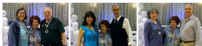
1st - East Coast Swing 2nd - East Coast Swing 3rd - East Coast Swing