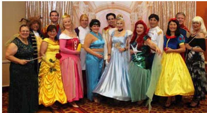
Bakersfield Friday Night Entertainment

Cinderella. Our fairy godmothers waved their magic wands, exclaimed "Bibbidi Bobbidi Boo!" and we emerged from the pages of a fairytale,