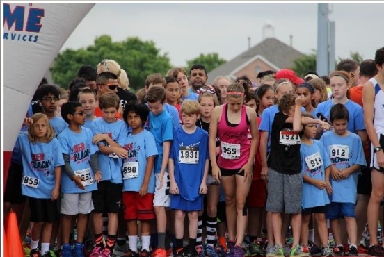
Over 600 participants at the annual Run to Fund 5K & 1 Mile Fun Run