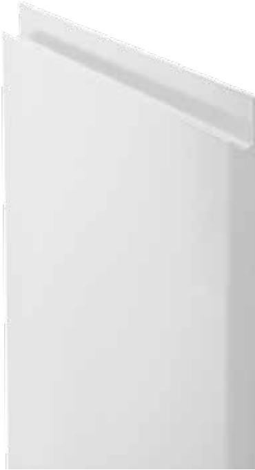
J PULL FINGER GRIP

Finger Pull doors and drawers are used in situations where a handle-less look is required.