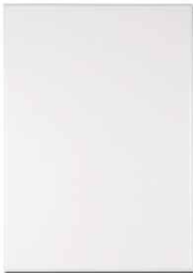
ETHAN BEVELLED 45° EDGE