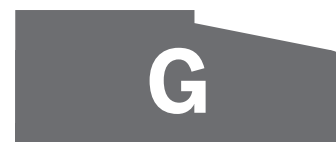
G BEVELLED STEP EDGE