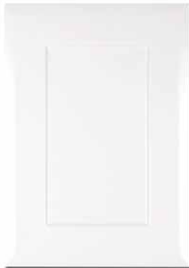
HANNA BEVELLED EDGE