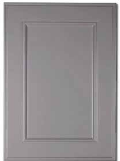
NOAH 3mm EDGE