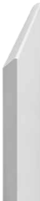
FINGER PULL 45° SHARK NOSE