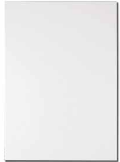
HAYLEY 3mm EDGE