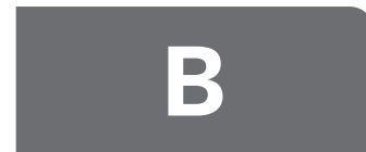
B 3mm EDGE