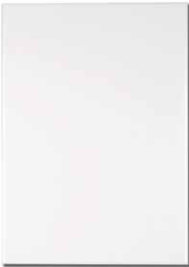
OLIVER 6mm EDGE