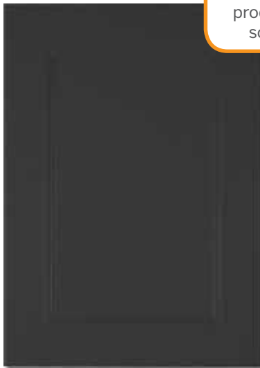
ANDREW 3mm EDGE

All doors can be produced in any solid colour