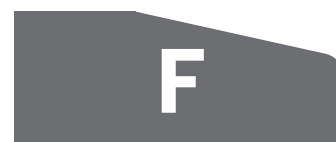
F BEVELLED EDGE