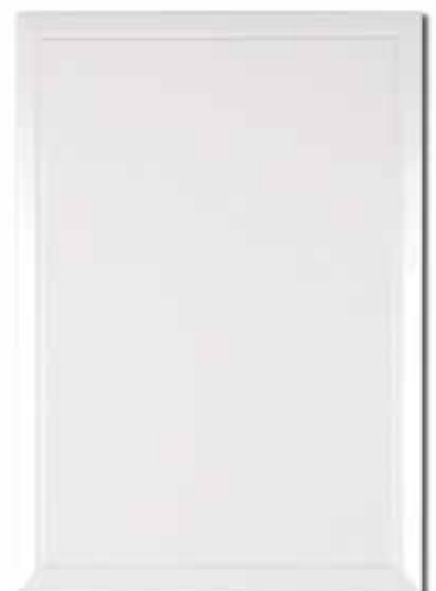
EMILY BEVELLED EDGE