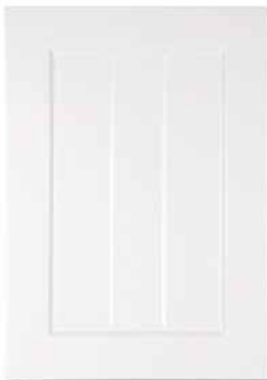
JOHN 3mm EDGE