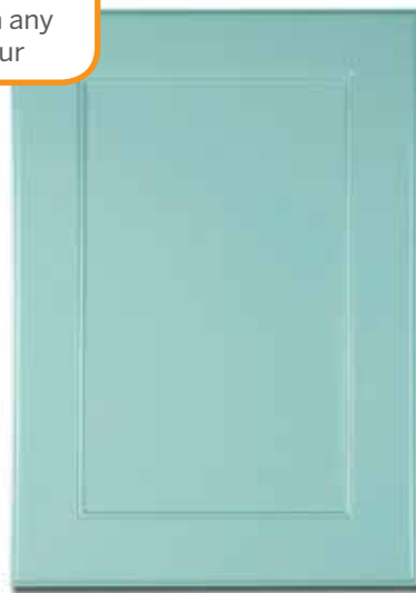
JACKSON OGGE EDGE