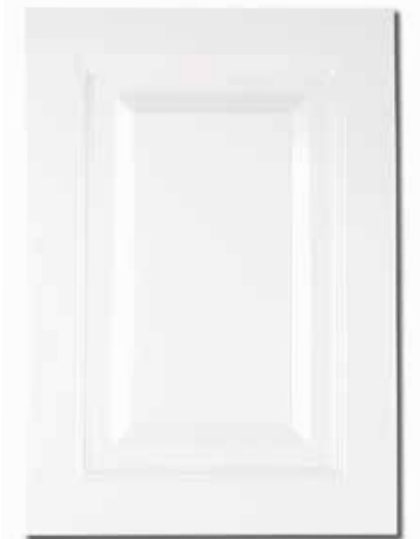
CORAL 3mm EDGE