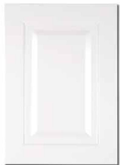
DANIEL 3mm EDGE