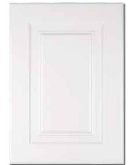
WILLIAM OGGE EDGE