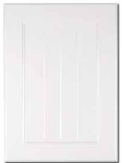
SOPHIE OGGE EDGE