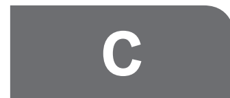
C 6mm EDGE