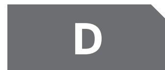
D BEVELLED 45° EDGE