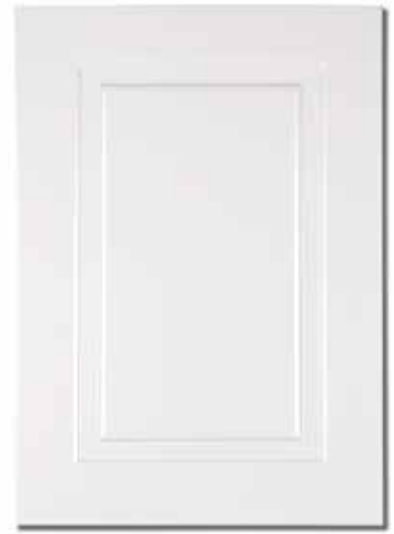
CHLOE 3mm EDGE