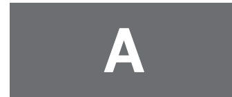
A SQUARE EDGE

Please note, when choosing a flat door style, the only difference is in the edge detail, hence there isn't provision for changing the edge detail on flat panel doors.