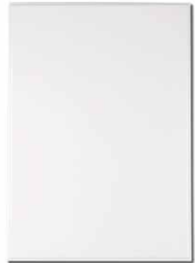
LILA OGGE EDGE