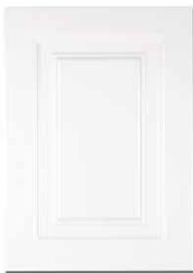
LOGAN 3mm EDGE