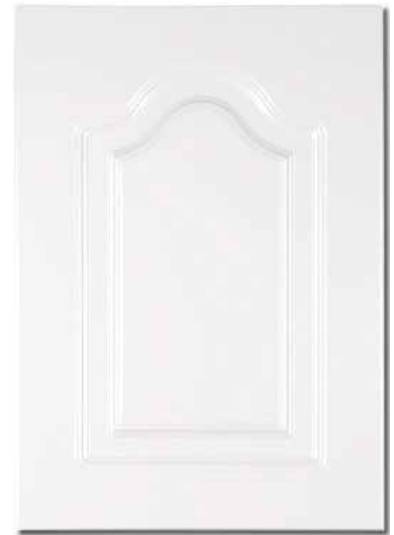
ALEXANDRIA 3mm EDGE