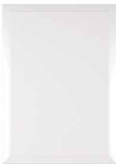
EMMA BEVELLED STEP EDGE