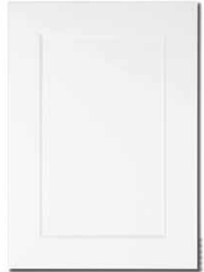
PETER 3mm EDGE

All doors can be produced in any solid colour