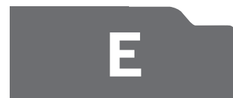
E OGGE EDGE