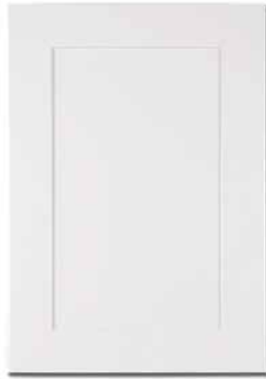
NATHAN 3mm EDGE

These are the eight Centre Rout profiles in the Poly range, these door styles consist of a inset centre rout combined with an edge detail of your choice.