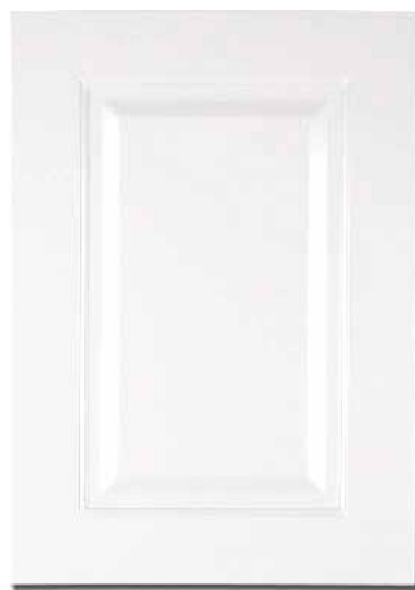
ADRIANA 3mm EDGE