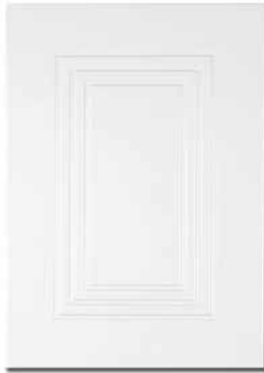
SHARON 3mm EDGE

These are the eight Pocket profiles in the Poly range, these door styles consist of a defined pocket rout with an edge detail of your choice.