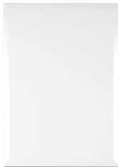
BELLA BEVELLED EDGE